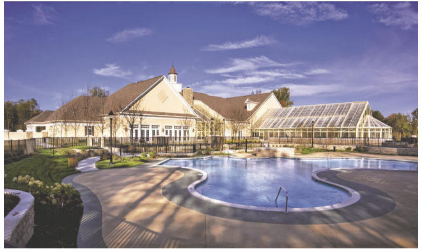
The clubhouse features three pools: an indoor pool and spa, an outdoor pool and a swimming area designed especially for grandchildren.