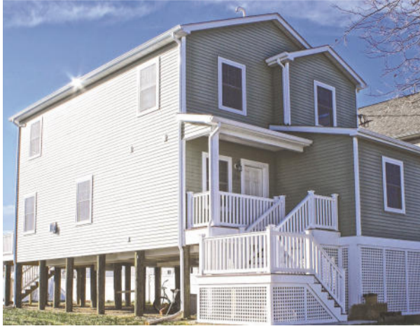
Homeowners new to modular construction now have the proof — modular is stronger.

advertising supplement to the asbury park press // view our listings at www.app.com/homes